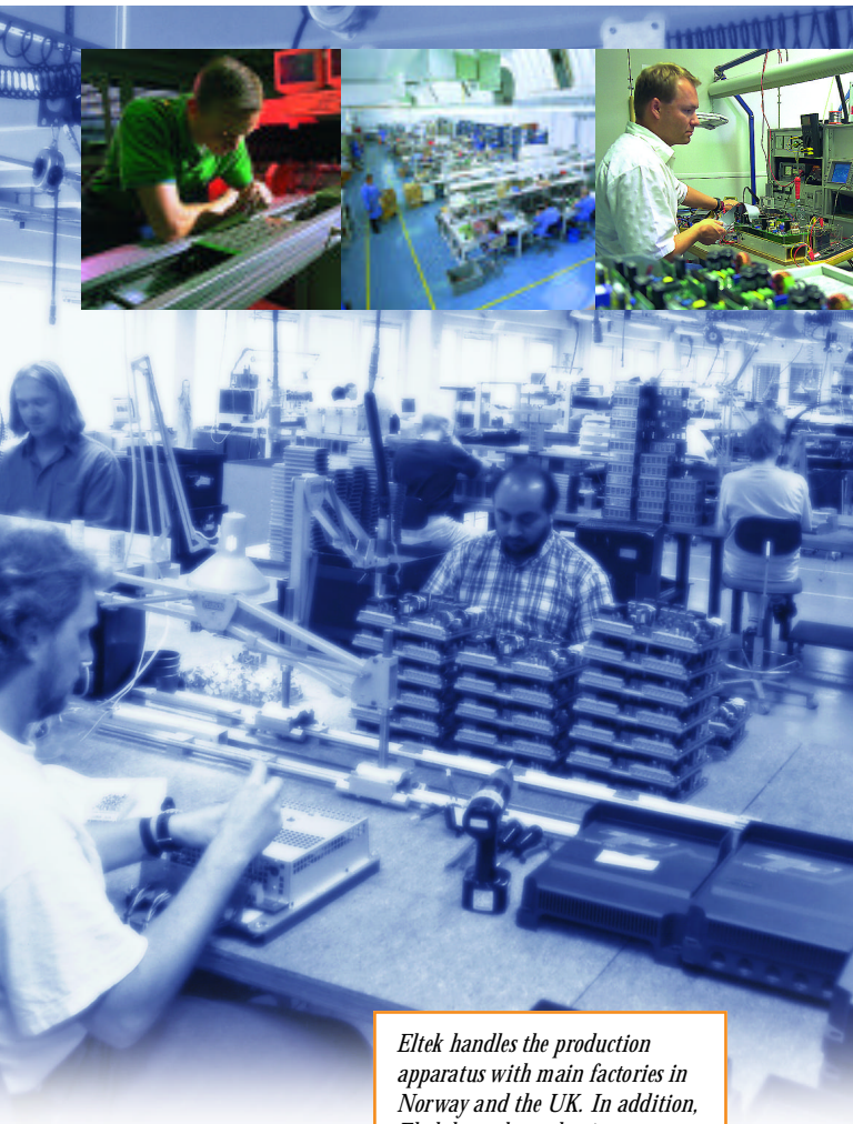
Eltek handles the production apparatus with main factories in Norway and the UK. In addition, Eltek has sub-production or production under licence in India and China. The production units are highly automated with emphasis on rapid switching between different product types.